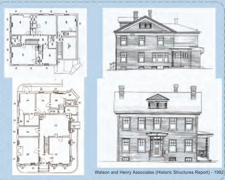
Watson and Henry Associates (Historic Structures Report) - 1992

Only two Detention Rooms existed in the Jail (Sheriff's House) from 1923 until 1986. Detention Rooms were across the hall from the family and children's bedrooms